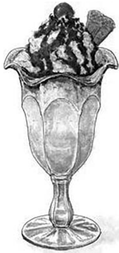
Chocolate Lava Cake With vanilla ice cream $10